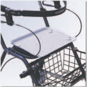
FOOD & BEVERAGE TRAY