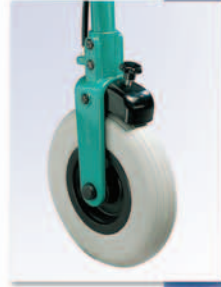
SLOW DOWN BRAKE