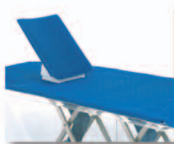
Reclining Straight Back