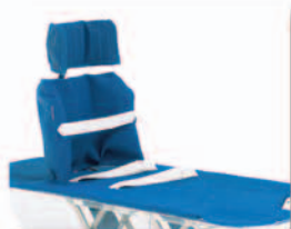
Head Support and Belts