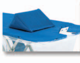
Sand Wedge Cushion