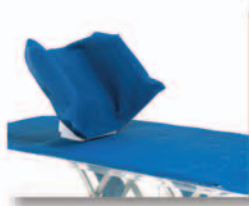
Reclining Special Back