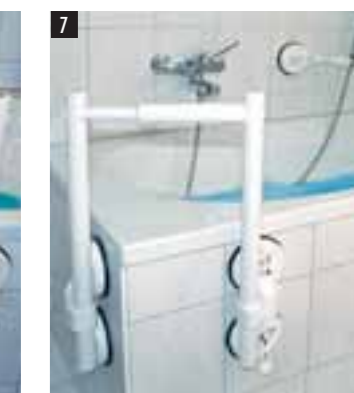
10/06 Änderungen vorbehalten.

D-72213 Altensteig Phone 00 49 74 53 / 93 81-0 Fax 00 49 74 53 / 93 81-23 info@roth-reha.de www.roth-reha.de