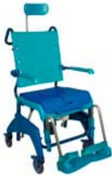
#1521473 Invacare ® HydroFlex