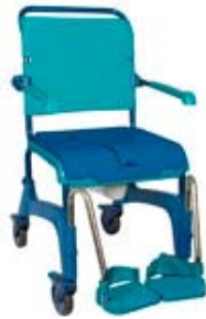
#1521472 Invacare ® HydroWave