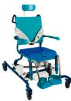
#1521474 Invacare ® HydroE-Flex

We are pleased to introduce the Invacare ® Hydro family. The chairs are similar to the Aquatec ® Ocean family, but the Invacare ® Hydro chairs convince with their green and blue color combination which is recommended for people with limited eye-sight.