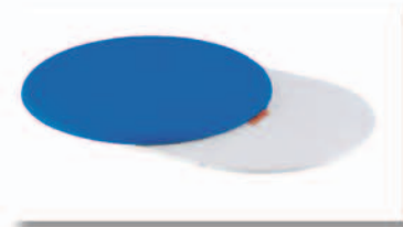
Rotary Seat with Transfer Board