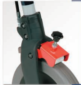
SLOW DOWN BRAKE