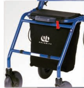
UNDER SEAT BAG

Accessories can enhance the use of your walker – the Tray gives you a platform to carry food, the Oxygen Tank Holder will safely support a B, C or D tank. A Cane Holder can secure a cane or crutch to the side of the walker, Slow Down Brakes have a tension control to allow individual settings for each wheel. One-Hand Brakes can control your braking from one handle. The Hemiplegic Handle allows you to use the body to push for momentum while braking is done with one hand. Under Seat Bag gives you a place to stash items out of sight.