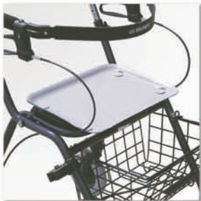
FOOD & BEVERAGE TRAY